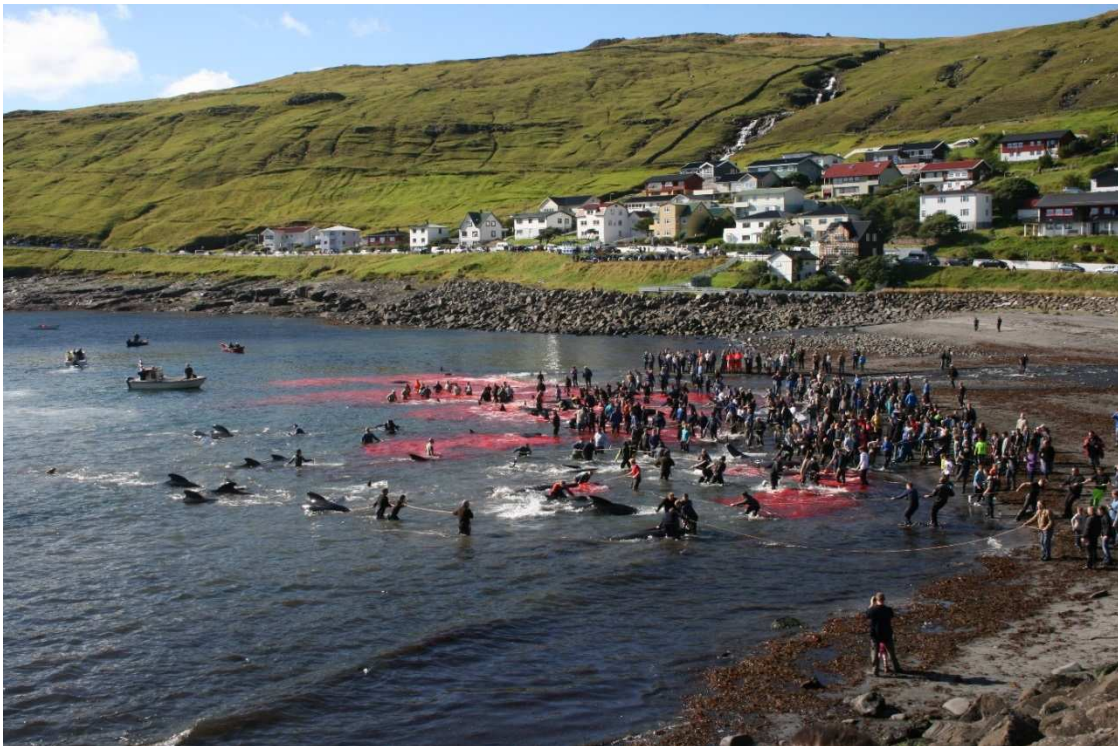
Figure 1: Grindadráp in Sandavágur in 2013.

The world at large became aware of grindadráp in the 1980s, with a number of environmental organizations beginning to protest against the practice since 1985 with sporadic campaigns occurring since (Joensen 2009). These campaigns have involved letter writing, occasional sabotage efforts and attempts to enact an economic boycott of Faroese (largely fish) products (Kerins 2010). Since the 1980s SSCS have been one of a group of organizations protesting against grindadráp . As such, SSCS have periodically campaigned in the Faroe Islands prior to Grindstop 2014, most recently in 2011, where their activities were broadcast as part of the television series Whale Wars . Partially as a reaction to the various protests, significant changes have occurred in governance of grindadráp : the PWA was formed, research was funded and continues into the population status of the pilot whale and a variety of changes to whaling equipment and methods were instituted in order to reduce the length of time required to kill a pod of pilot whales (Fielding 2010: 433). Support for grindadráp , whilst difficult to gauge precisely, remains high within the Faroese population: one random, weighted survey of 528 people (approximately 1% of the population) conducted before SSCS arrived in the islands determined 77% of those sampled felt that it was right to continue driving whales, with 12% stating it should cease (Gallup Føroyar 2014).