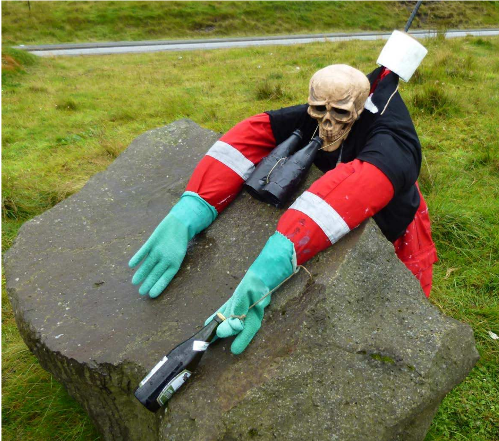
Figure 4: The SSCS 'crewmember' that appeared on the road into Tórshavn.

global goals and dialogue largely pointless. Indeed, most media appeared to be aimed more at an international rather Faroese audience. By contrast, the representations and actions of defenders of the FPW were decidedly more local. FPW orderers would painstakingly explain this for both domestic and international audiences while the actions of Faroese (and Danish) authorities decisively enacted this ordering when SSCS activists crossed the line of 'legitimate protest.'