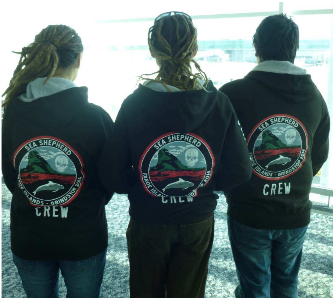
Figure 2: Three SSCS onshore crewmembers, displaying the Grindstop 2014 logo.

of people to oppose and protest against grindadráp within the bounds of Faroese law but stated they had "no basis for dialogue or cooperation with [SSCS]" (Wang 2014). SSCS activists were largely tolerated but were met with overwhelming force in the event of grindadráp : Danish military forces were stationed in the Faroes throughout the summer and large numbers of police deployed rapidly to relevant whaling beaches whenever a whale drive looked to be taking place (e.g. at an intended drive in Hvalba [Olsen 2014]) and quickly sealed off the area. During the summer, the official response was criticized for failing to actively contest SSCS' media campaign (Lindenskov 2014f) and the Faroese parliament discussed whether more action should be taken in future (Gregersen 2014).