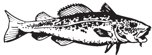
Fig. 2: Gadus morhua

The hydrography is complicated, especially at depths beyond 500 m. The water masses in the area of the bank comprise both cold and dense bottom water from the Norwegian Sea flowing Northwest-wards on the Eastern flank of the bank through the Faroe Bank Channel into the North Atlantic, and warmer Atlantic water on the Southern side of the bank. The surface water of the bank is solely of Atlantic origin and flows in an anticyclonic circulation above the bank creating a retention area whereof the degree of isolation varies with time. The sediment of the bank mainly consists of shell and gravel sand with spots of seabed and stone rock and larger areas of soft bottom on the Southern margin of the bank.